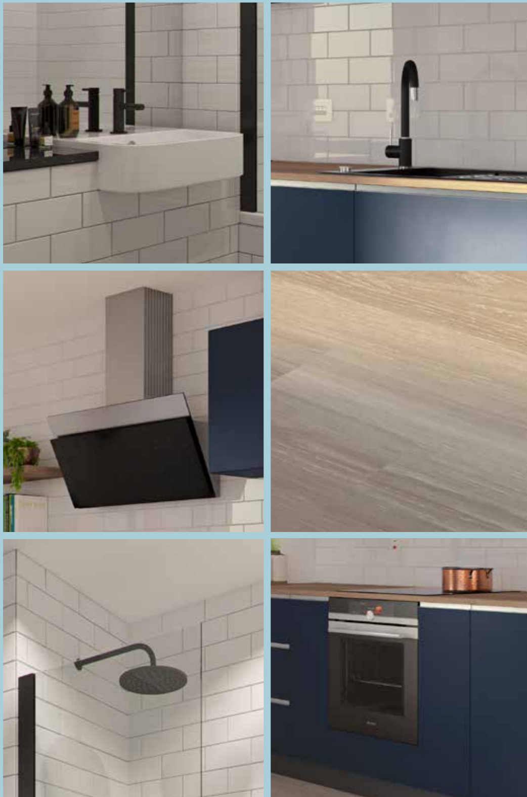
Computer generated images of Home X are indicative only.