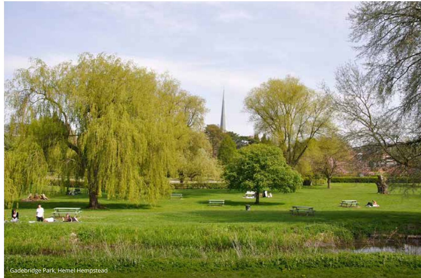
Gadebridge Park, Hemel Hempstead

Hemel Hempstead is conveniently located for motorists with the M1, M25, M10, A41 all easily accessible. Trains go direct into London Euston in under 30 minutes from Hemel Hempstead Train station