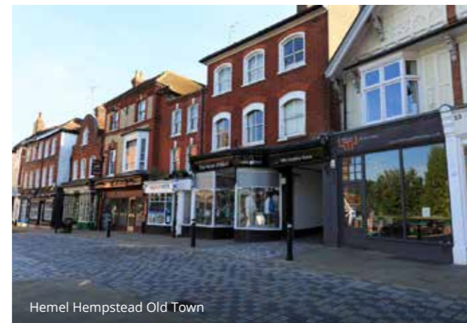
Hemel Hempstead Old Town