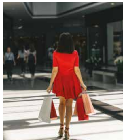
Westfield Stratford City is one of the largest urban shopping centres in Europe.

Stratford is a powerhouse of ideas and innovation, a place that is about feeling exhilarated and energised even without an adrenaline filled ride on the world's longest tunnel slide at the ArcelorMittal Orbit. The architecture of the world-class sports and event venues create a skyline that can only be Stratford, with the Westfield shopping destination the place to find stores usually only found in the West End and fresh new global brands making their first UK footprint here, a choice of 20 screens at Vue, gaming arenas, a bowling alley and 83 different places to eat and drink set among four food precincts. Vegan, halal, or gluten-free, the sheer choice of eateries and food styles means you'll find it here. ■