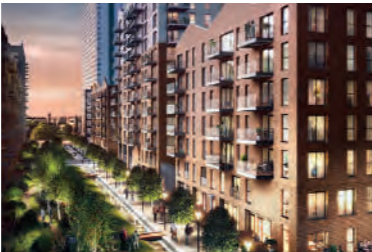
L&Q at Deptford Landings – Deptford lqhomes.com/deptfordlandings