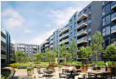
L&Q at Greenwich Square – Greenwich lqhomes.com/greenwichsquare

L&Q at Hayes Village Nestles Avenue Middlesex UB3 4QF