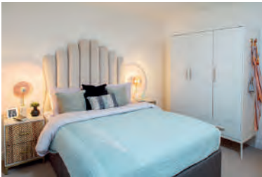
L&Q at Regency Heights – Park Royal lqhomes.com/regencyheights