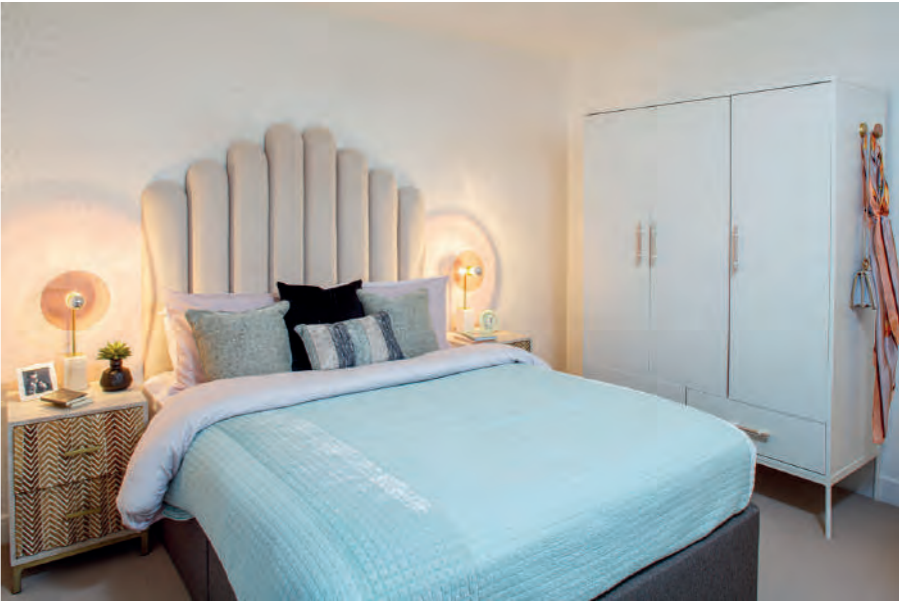
With Abingdon carpets and bespoke mirrored wardrobes, bedrooms are move-in ready. All that's left to do is add your own personal touch.