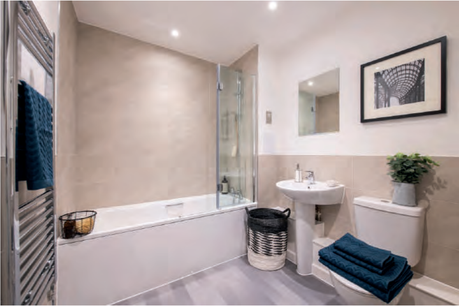
Chrome finishes, hardwood floors and ceramic tiling make your bathroom at Hayes Village stylish and practical.