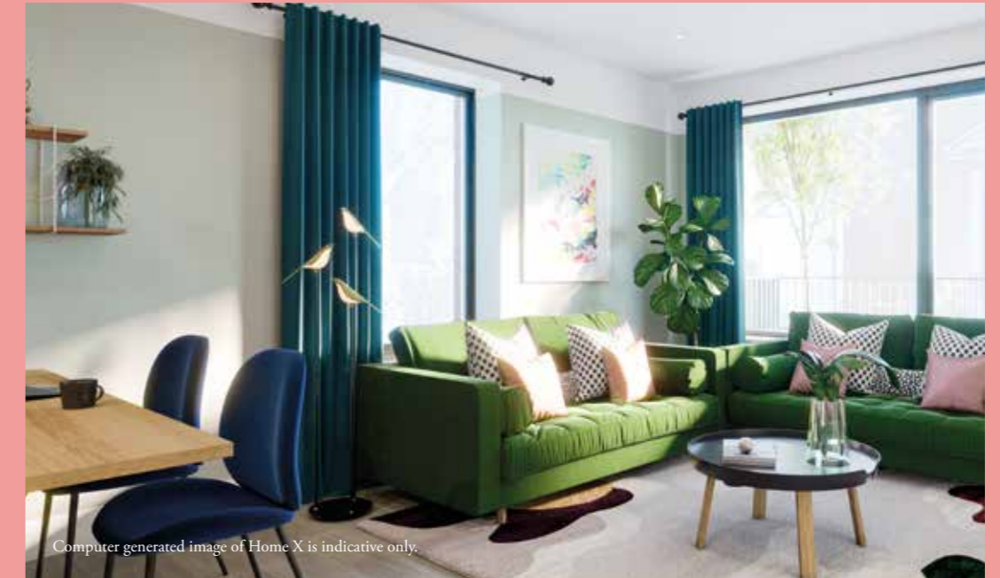
Computer generated image of Home X is indicative only.