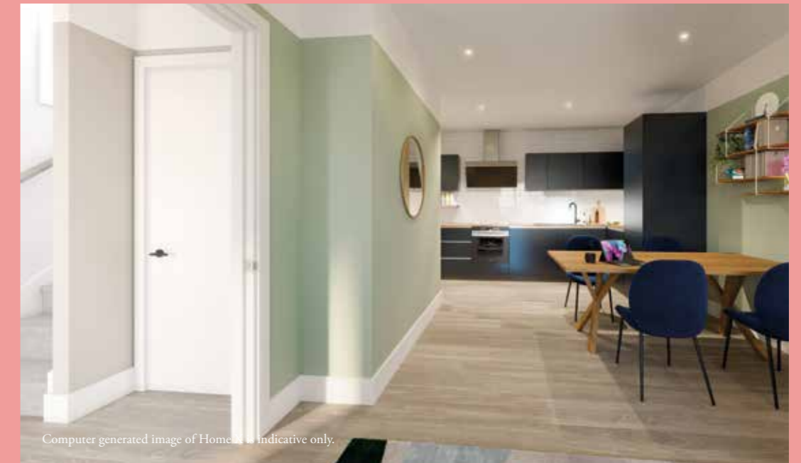
Computer generated image of Home X is indicative only.