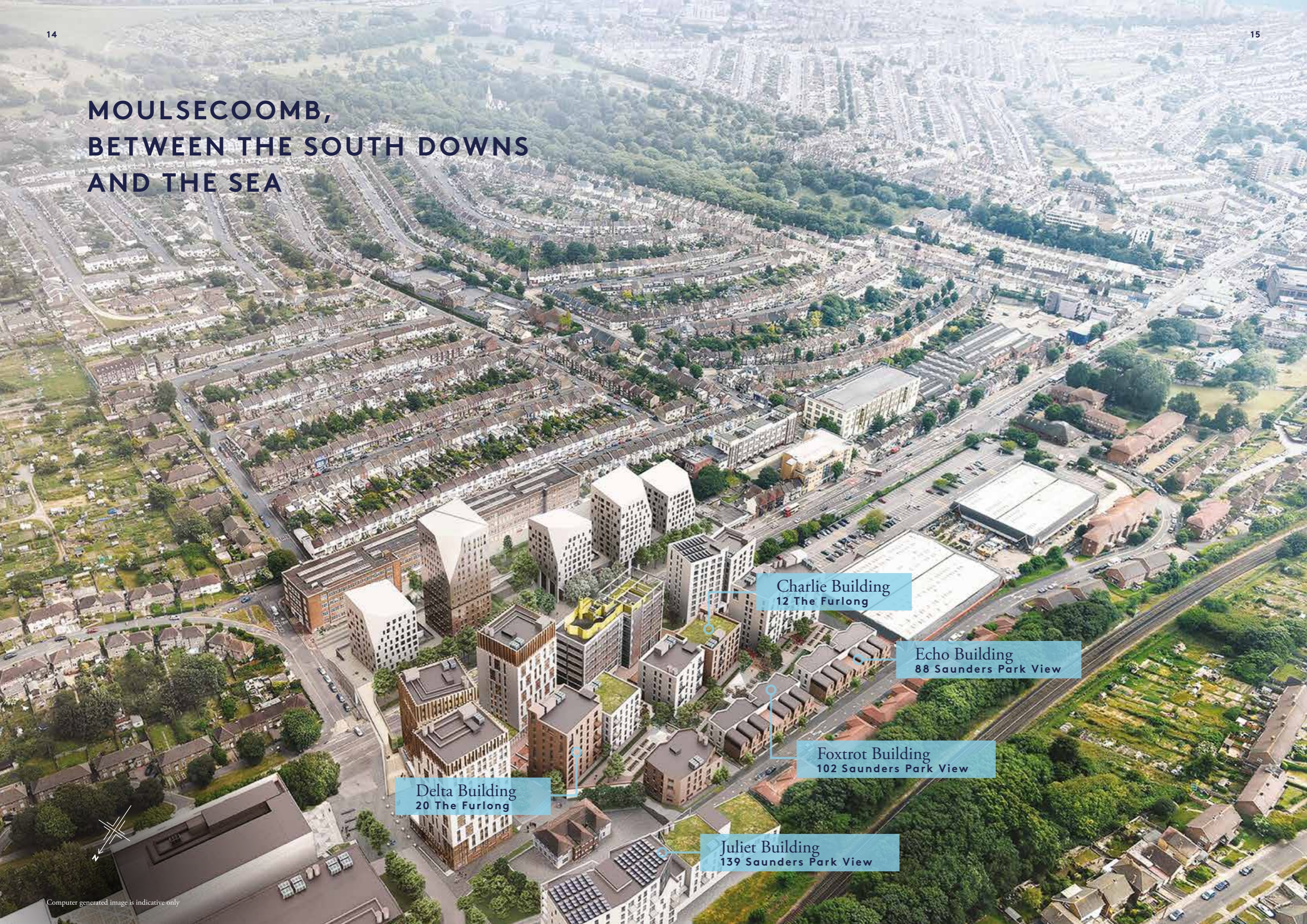
Charlie Building 12 The Furlong