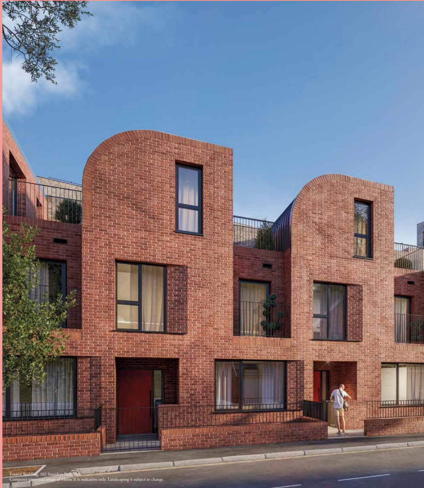
Fox Trot Building, 102 Saunders Park View Computer generated image of Home X is indicative only. Landscaping is subject to change.