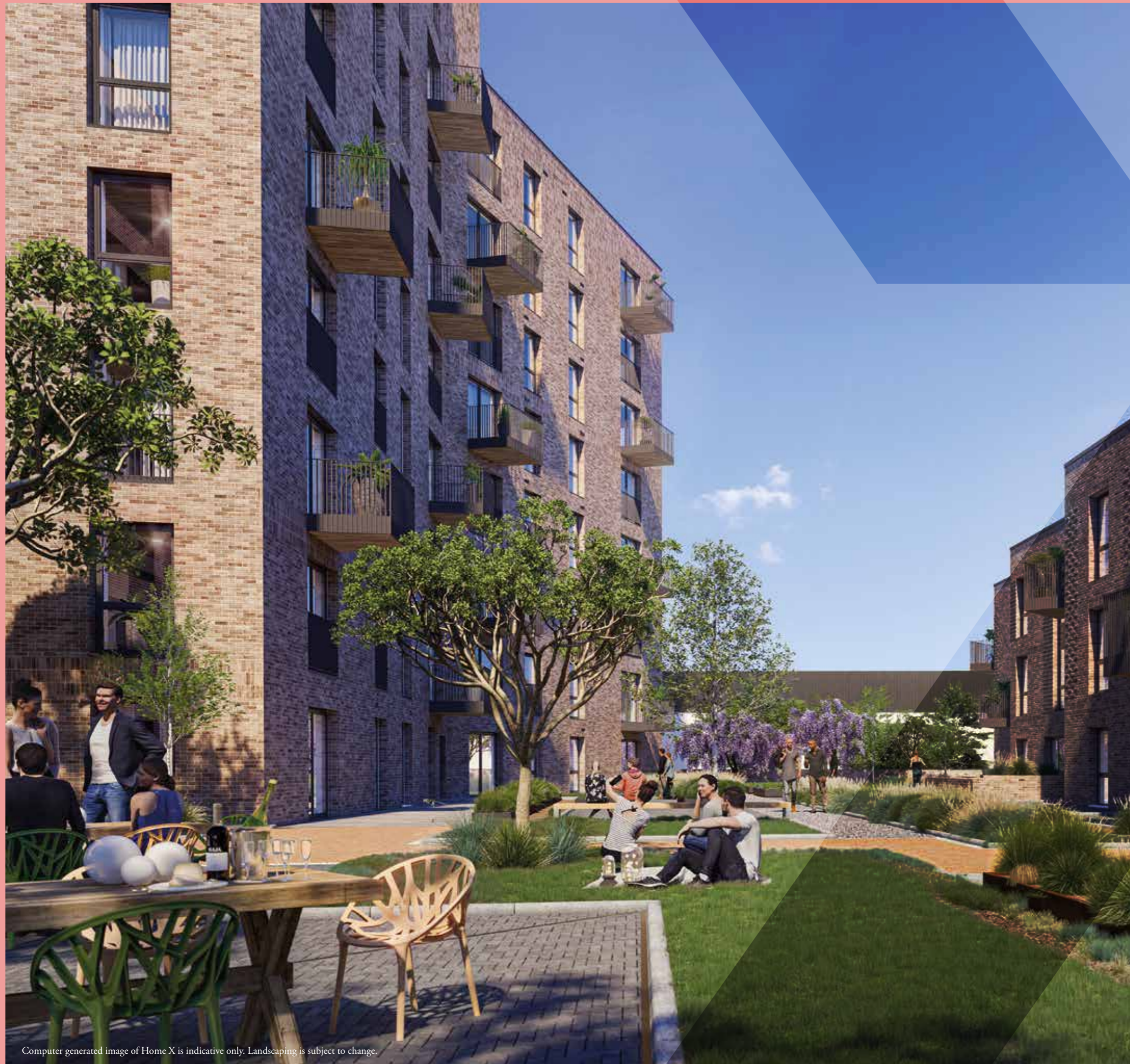
Computer generated image of Home X is indicative only. Landscaping is subject to change.