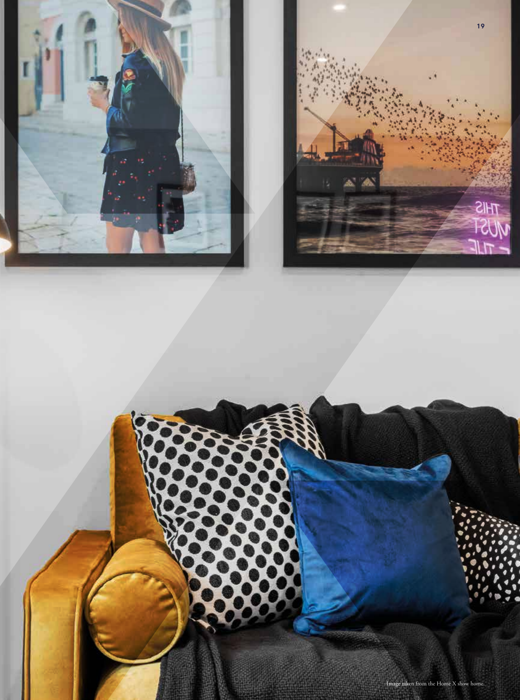
Image taken from the Home X show home.

*Eligibility criteria applies. Ask our sales team for more details.