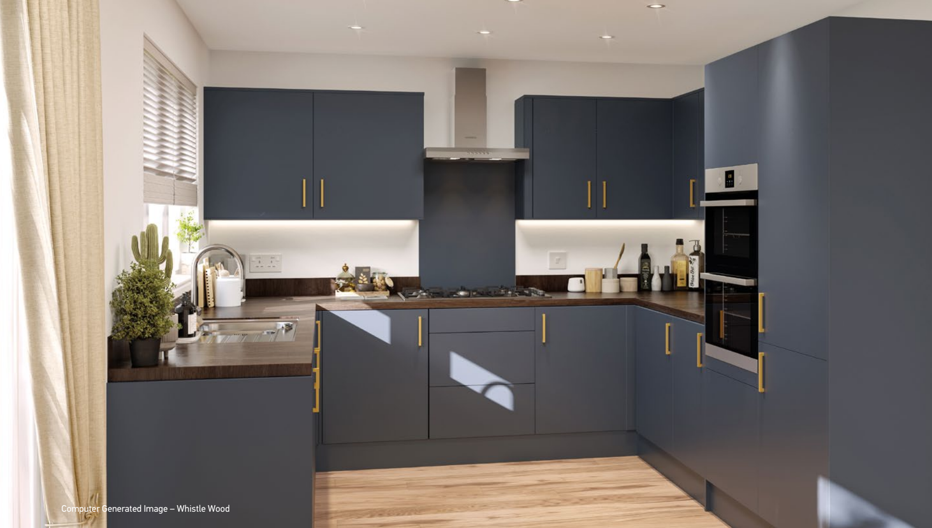
Computer Generated Image – Whistle Wood