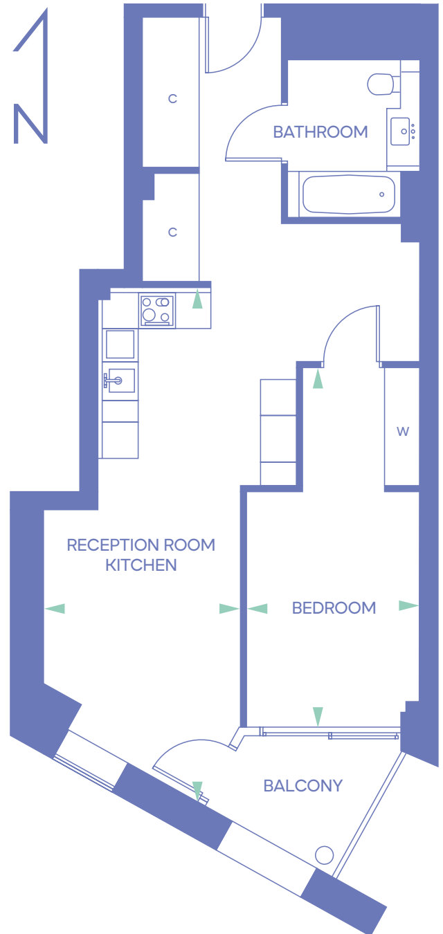
W - Wardrobe | C - Cupboard