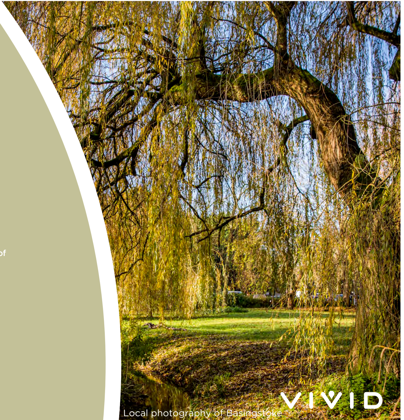
Local photography of Basingstoke

There's a great choice of Ofsted-rated Good and Outstanding schools within a three-mile radius. For outdoor enthusiasts, VIVID On The Green is close to the countryside and the Wessex Downs is within easy reach too.