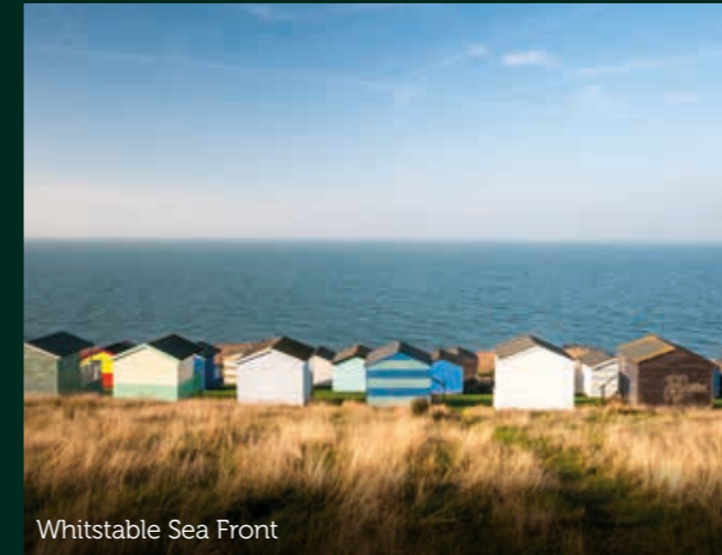
Whitstable Sea Front