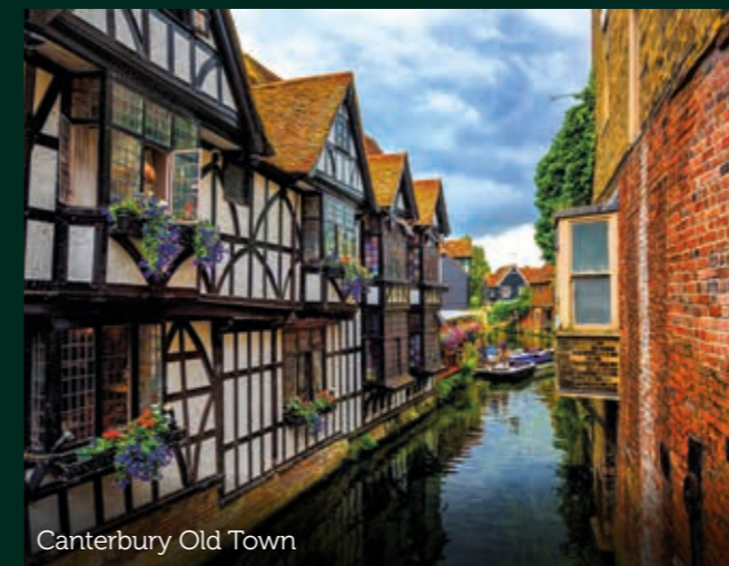
Canterbury Old Town