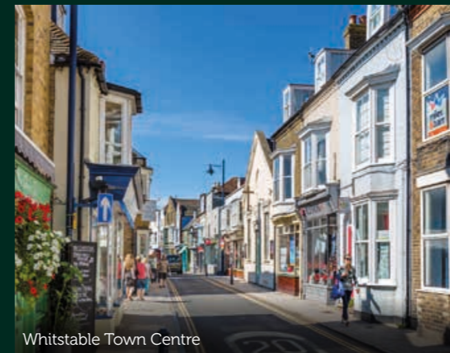
Whitstable Town Centre