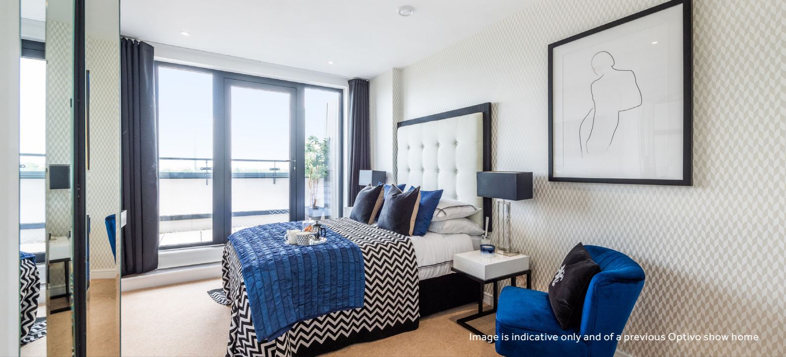
Image is indicative only and of a previous Optivo show home