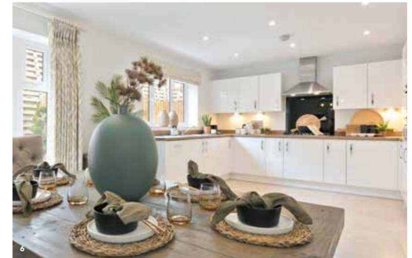
1-5 Computer generated images 6-11 Show home images from a previous Latimer development