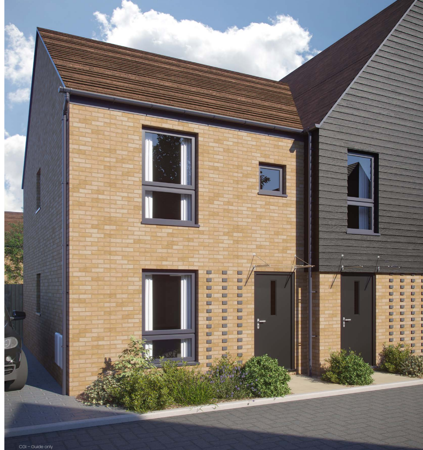
CGI - Guide only

Please contact us to request individual floor plan copies