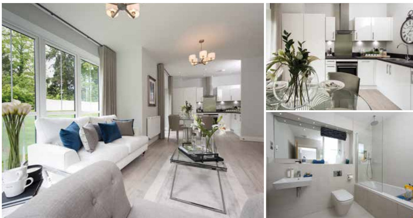
Internal photography indicative only