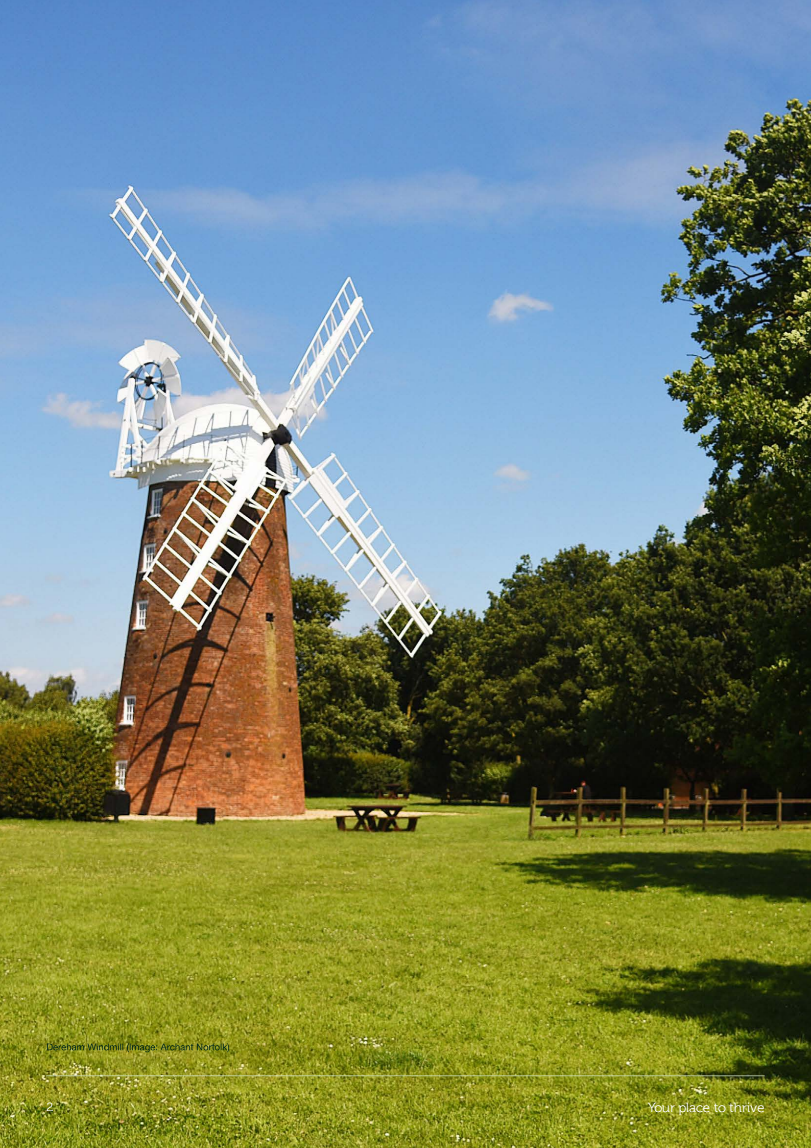
Dereham Windmill