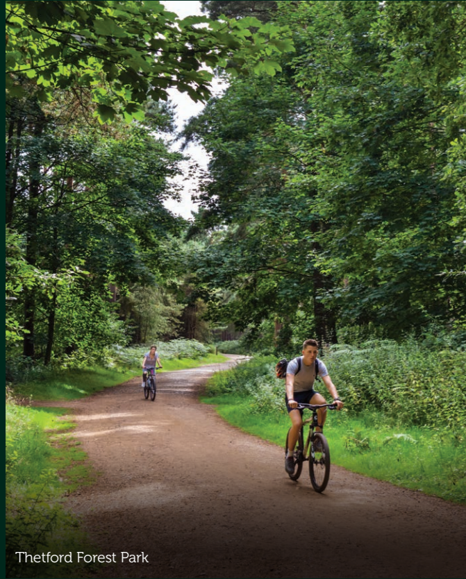
Thetford Forest Park

Dereham really does lie right at the heart of Norfolk, the perfect gateway to all that this rural county has to offer. The magnificent Thetford Forest Park is around 25 miles away – a wonderful place for families to enjoy leafy walks, bike trails, or simply immerse themselves in the local flora and fauna.