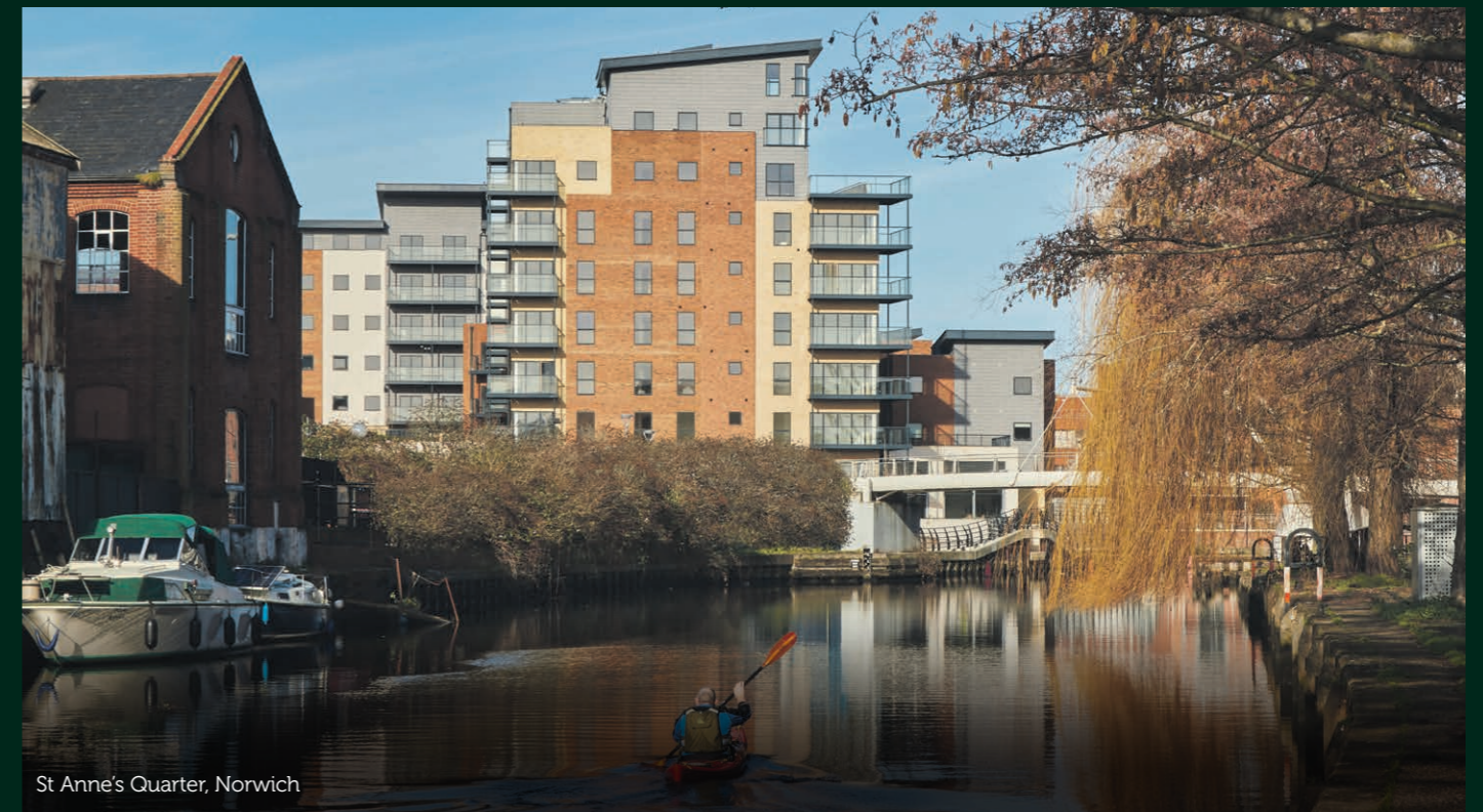
St Anne's Quarter, Norwich