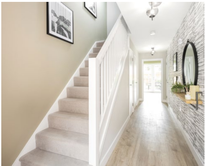
Interior images are from previous Hill developments with a similar specification

Homes at Timber Works are full of details that give you and your family a stylish, contemporary home that's designed for modern living.