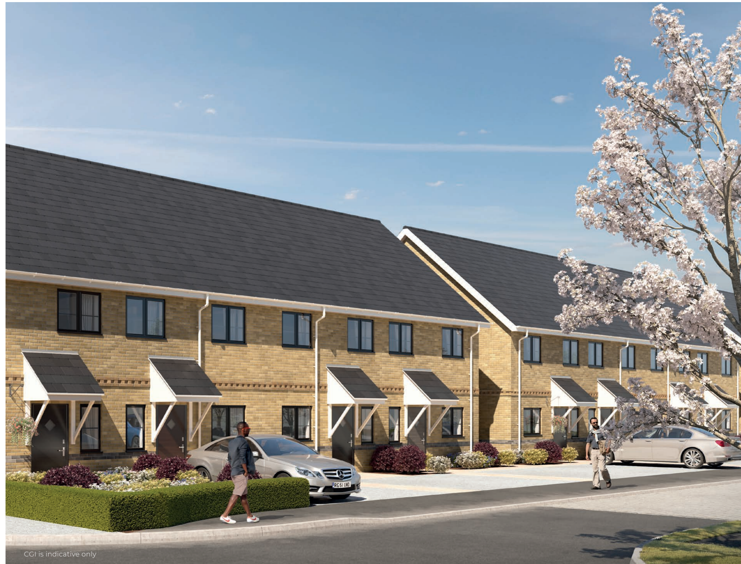
CGI is indicative only

*Travel times are taken from nationalrail.co.uk