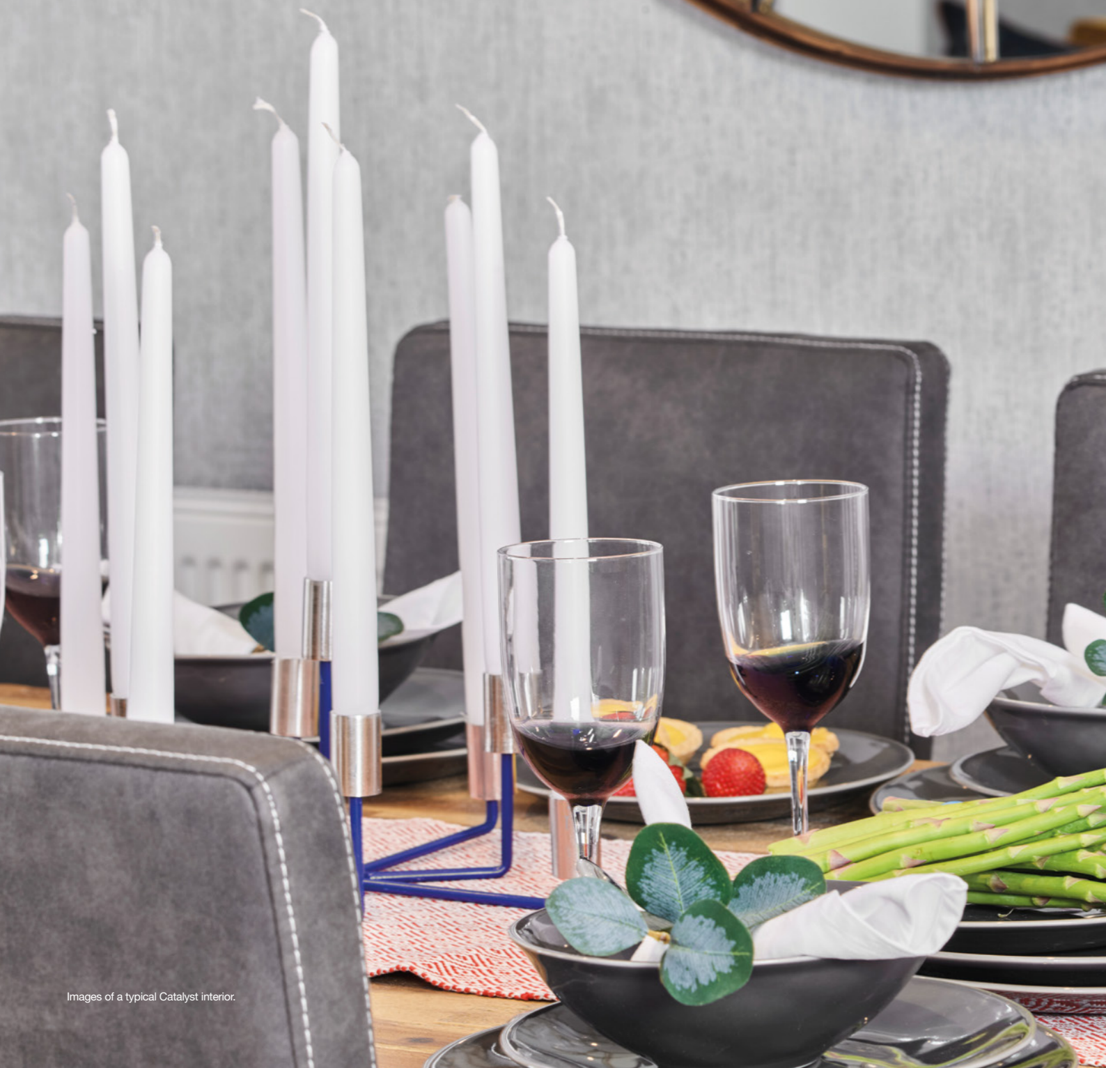
Images of a typical Catalyst interior.