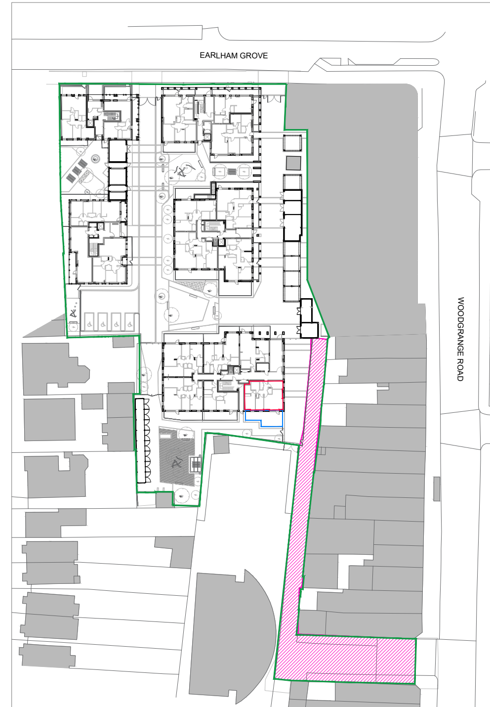
GROUND FLOOR PLAN, PLOT CG.02