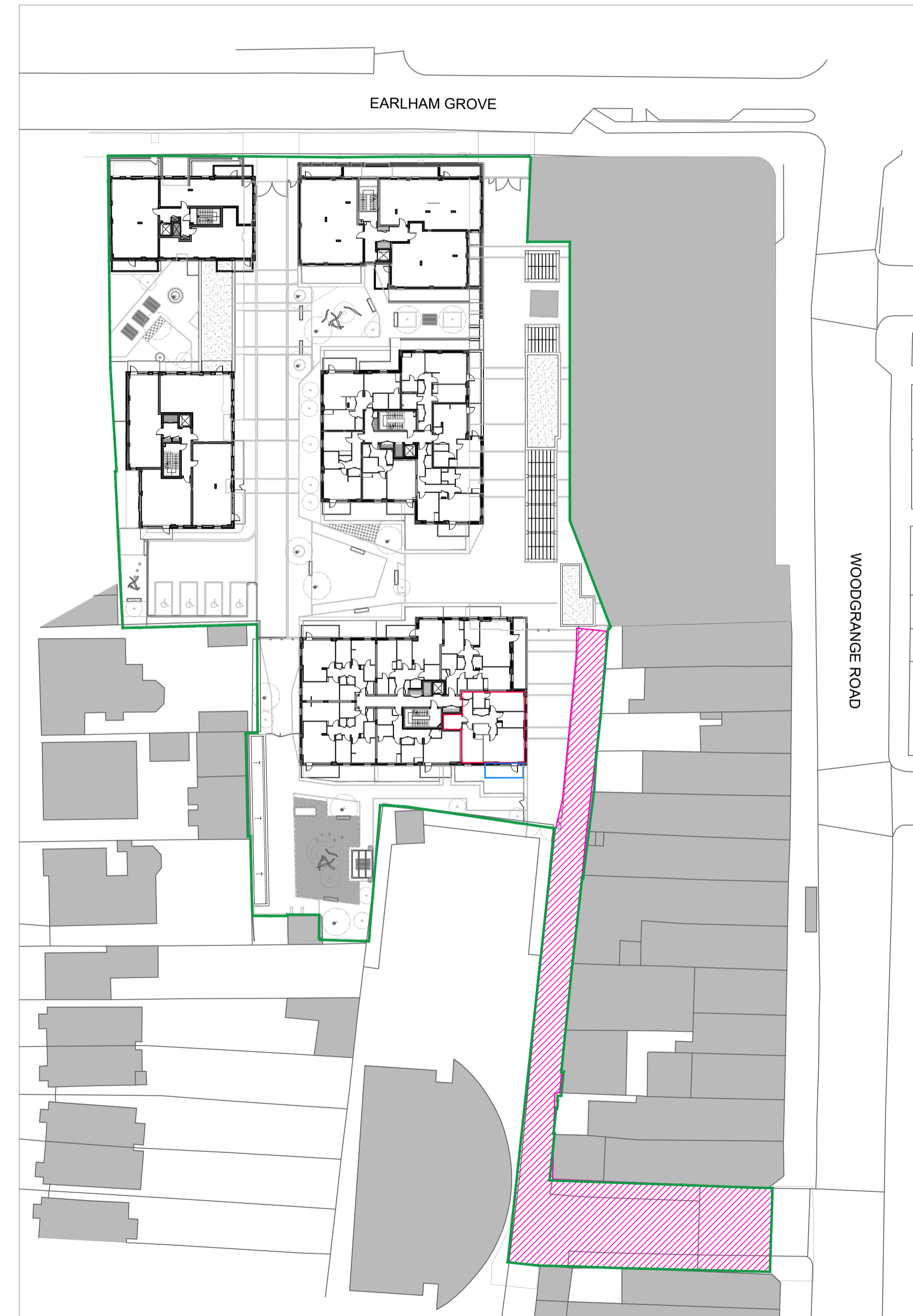
SECOND FLOOR PLAN, PLOT C2.01