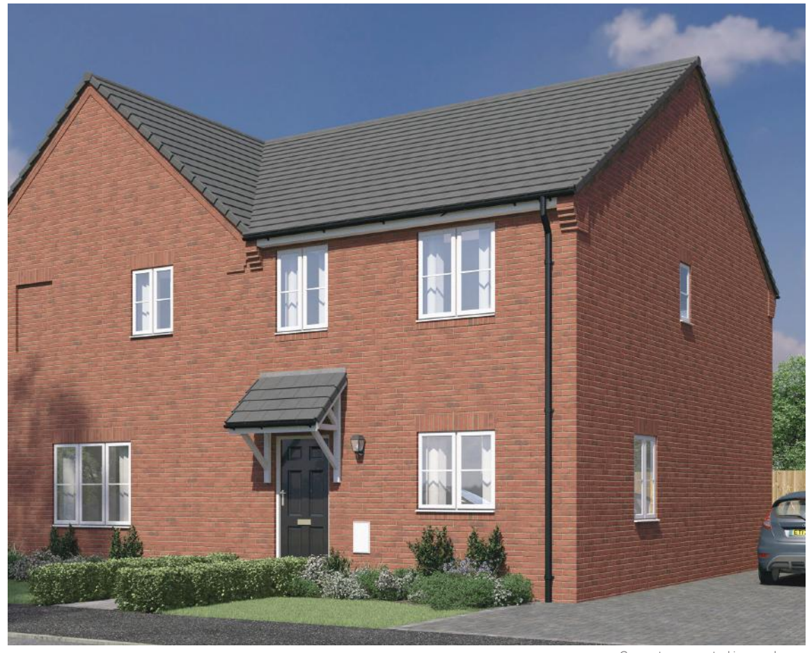
Computer generated image shown.