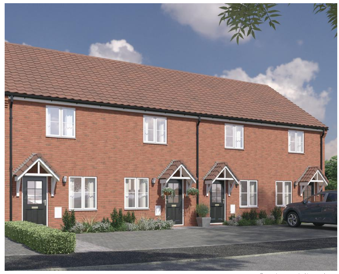
Computer generated image shown.