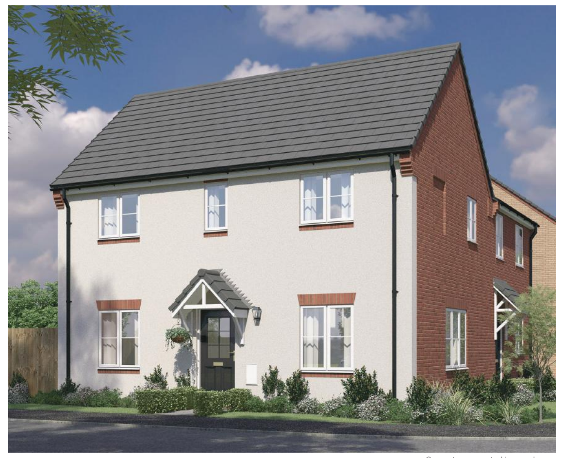
Computer generated image shown.