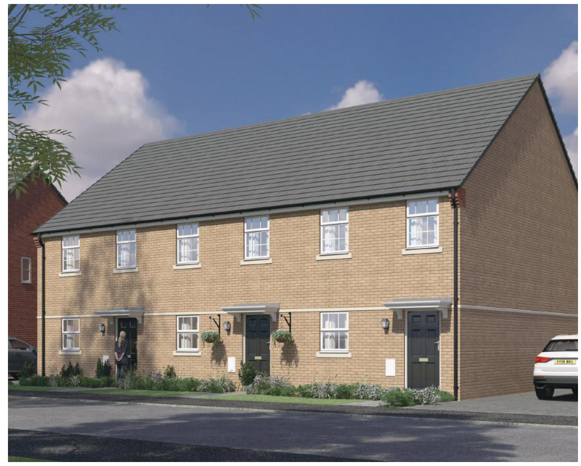
Computer generated image shown.