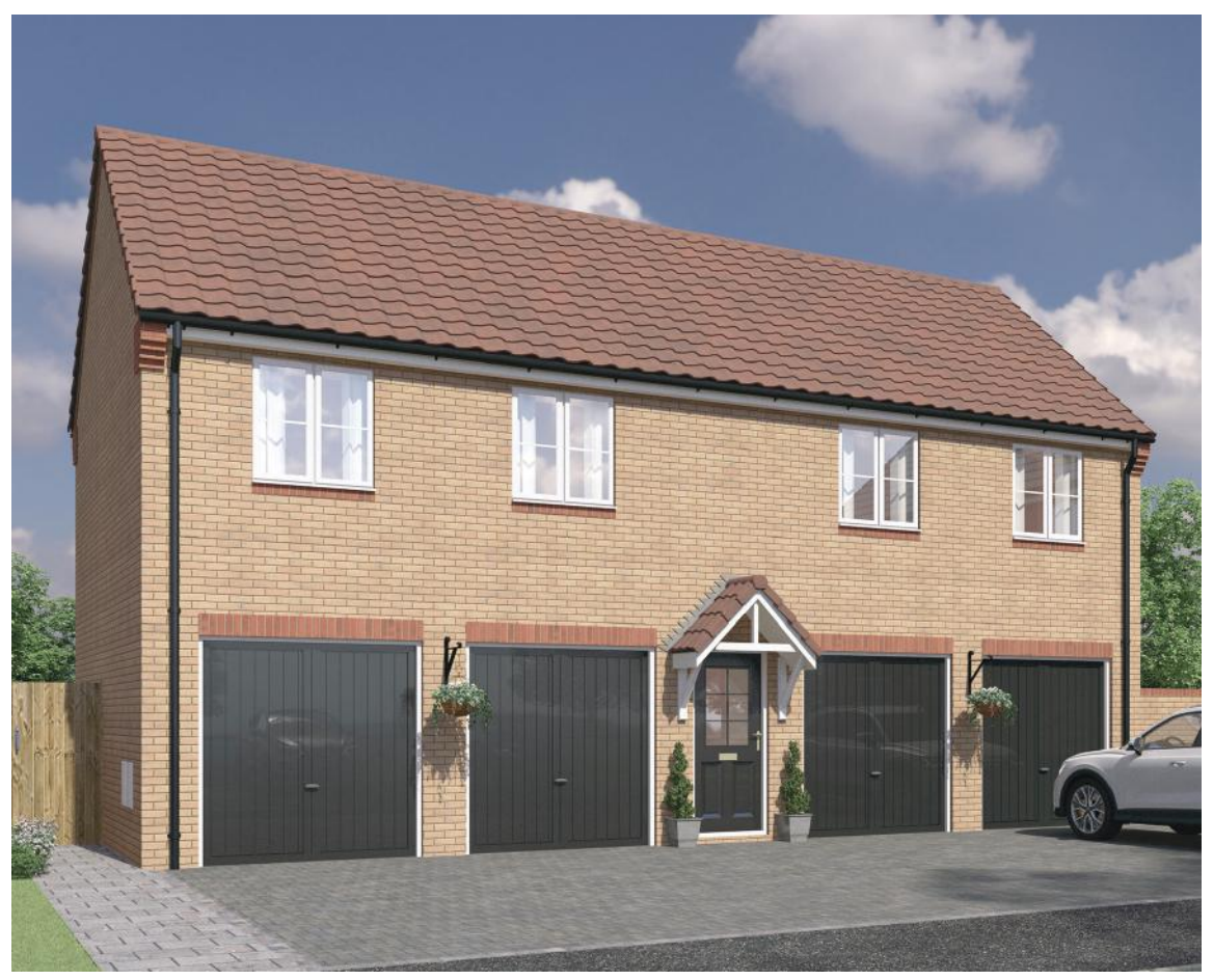
Computer generated image shown.