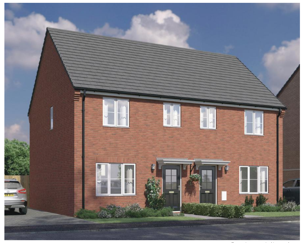
Computer generated image shown.