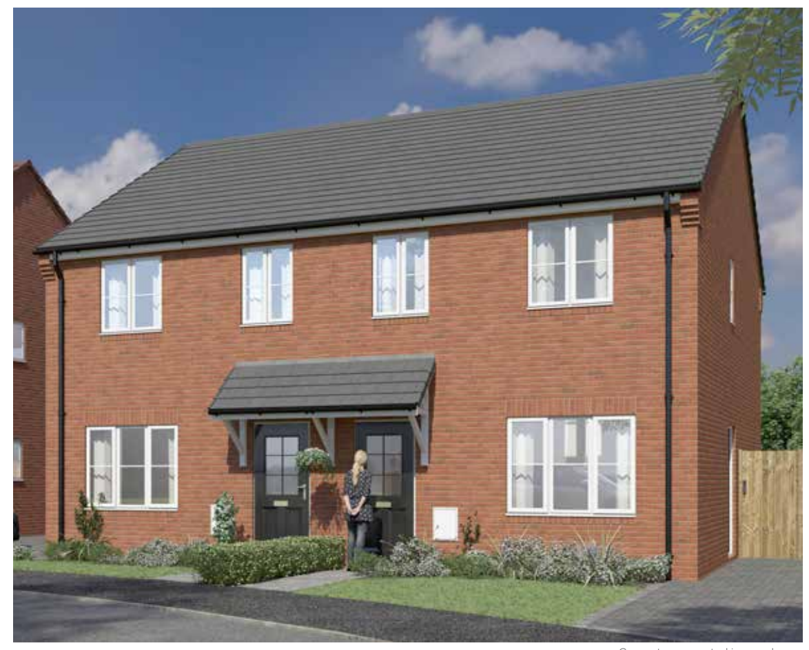
Computer generated image shown.