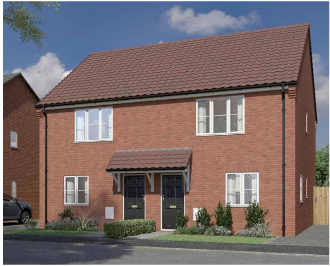
PLEASE NOTE: Plot 78 wil be a end-terrace plot and not a Semi-Detached as shown in the computer generated image.