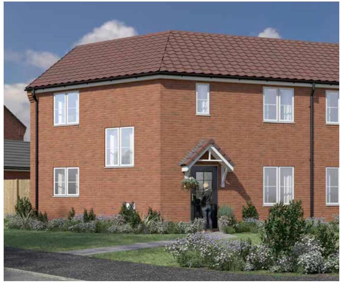
Computer generated image shown.