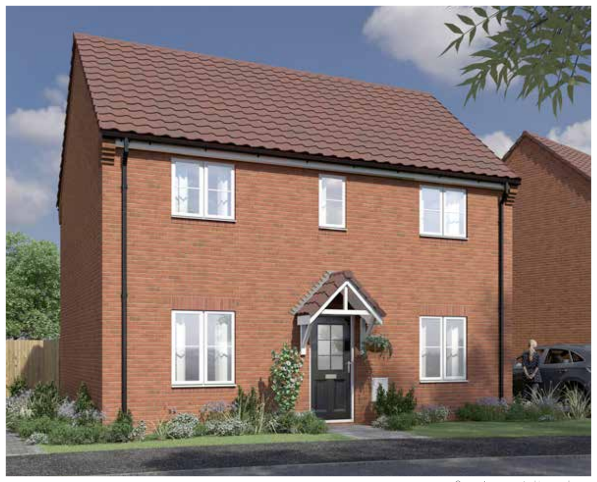
Computer generated image shown.