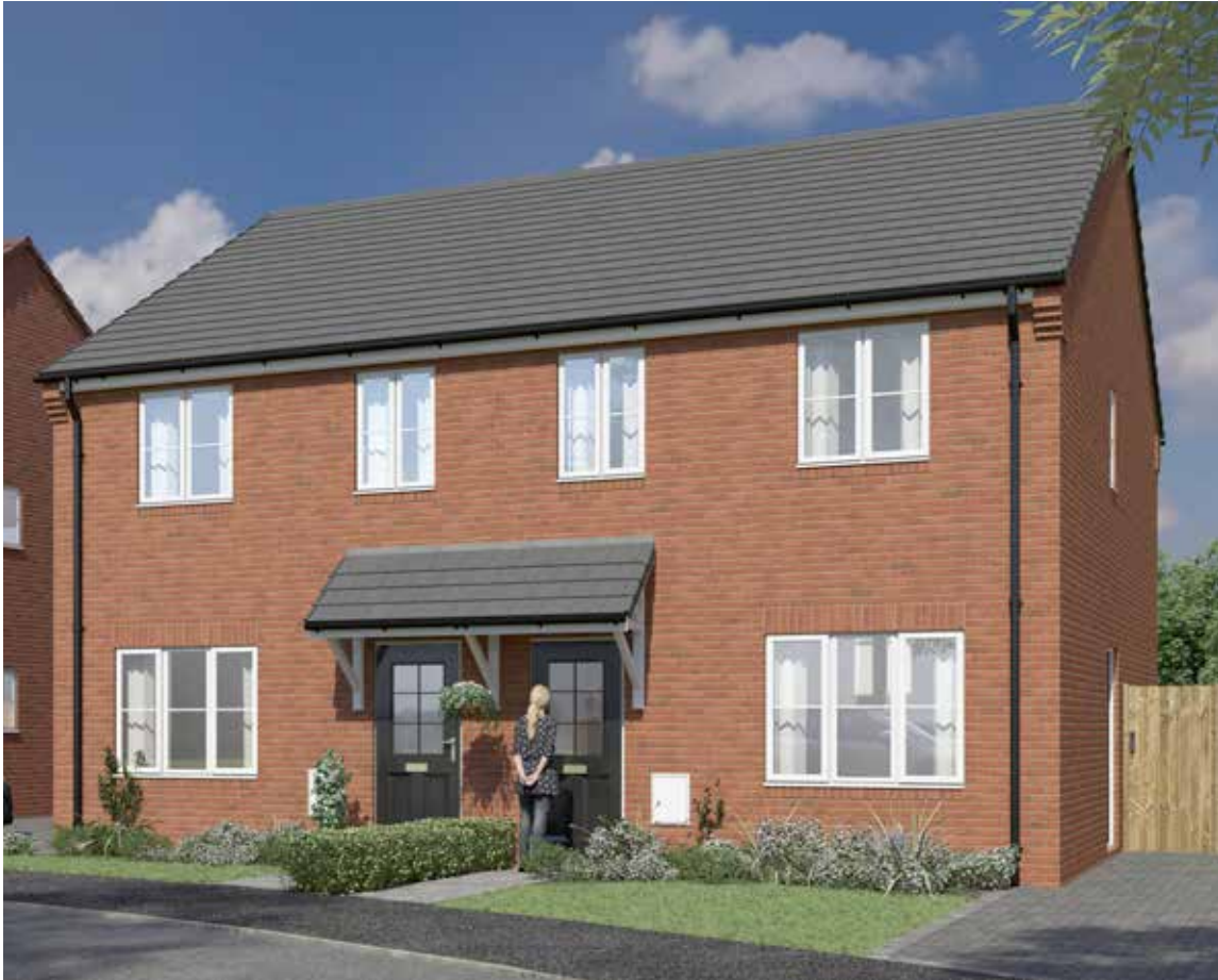
Computer generated image shown.