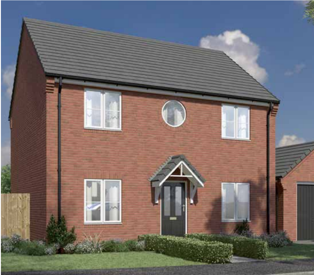
Computer generated image shown.