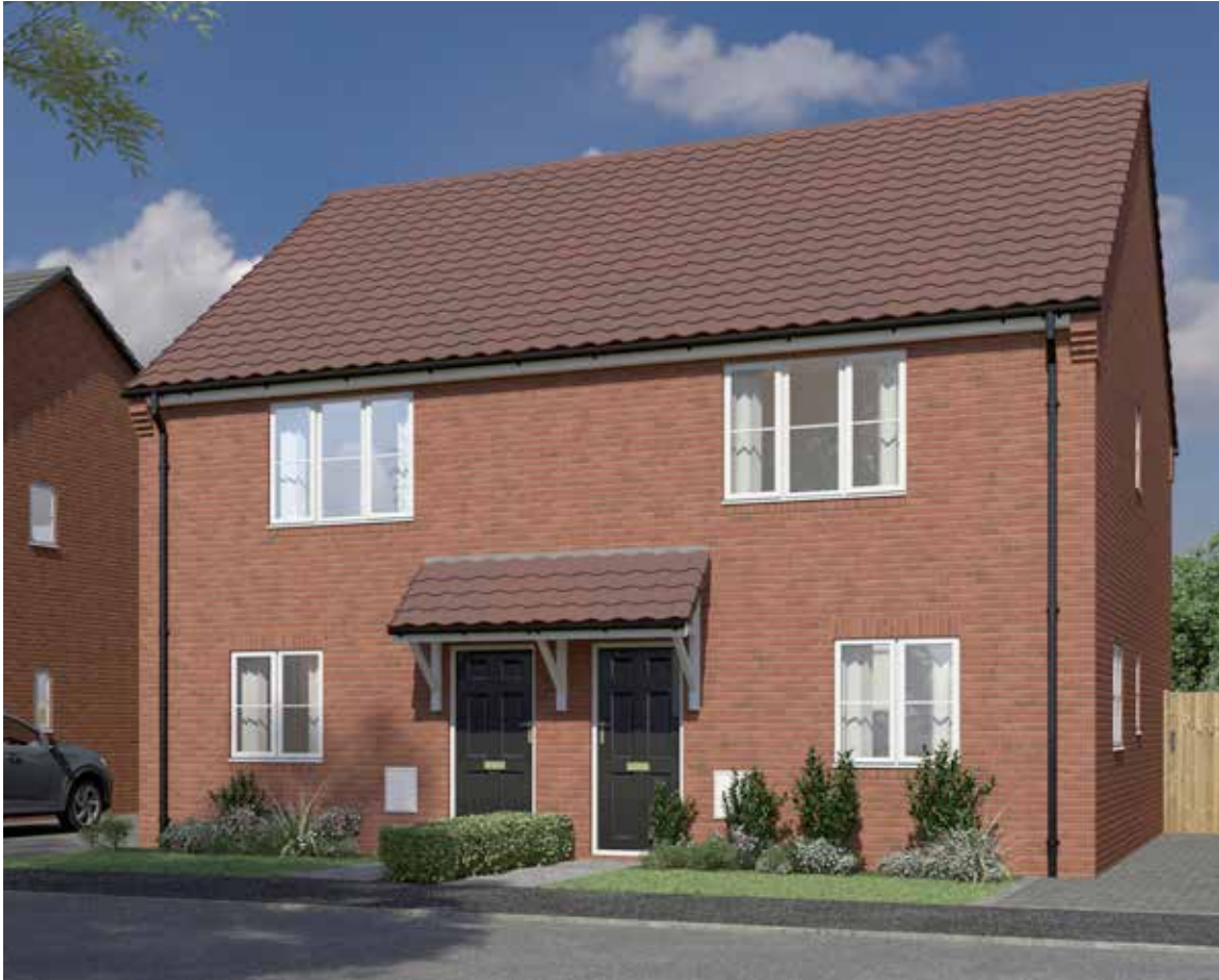
PLEASE NOTE: Plot 78 will be an end-terrace plot and not a Semi-Detached as shown in the computer generated image.