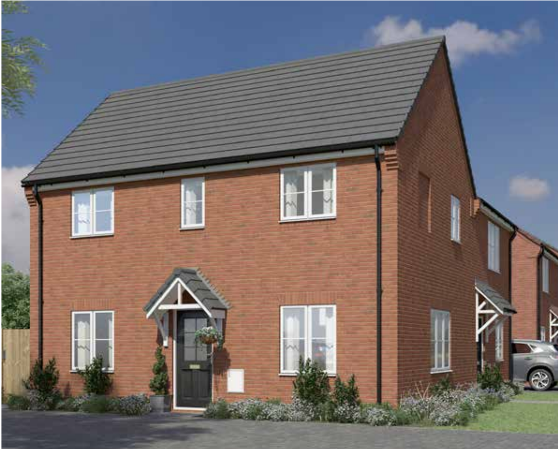
Computer generated image shown.