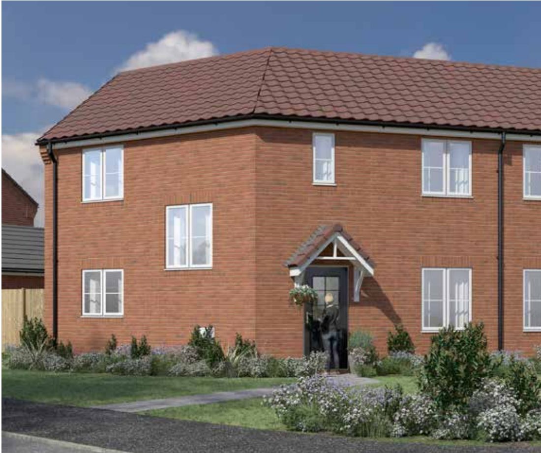
Computer generated image shown.