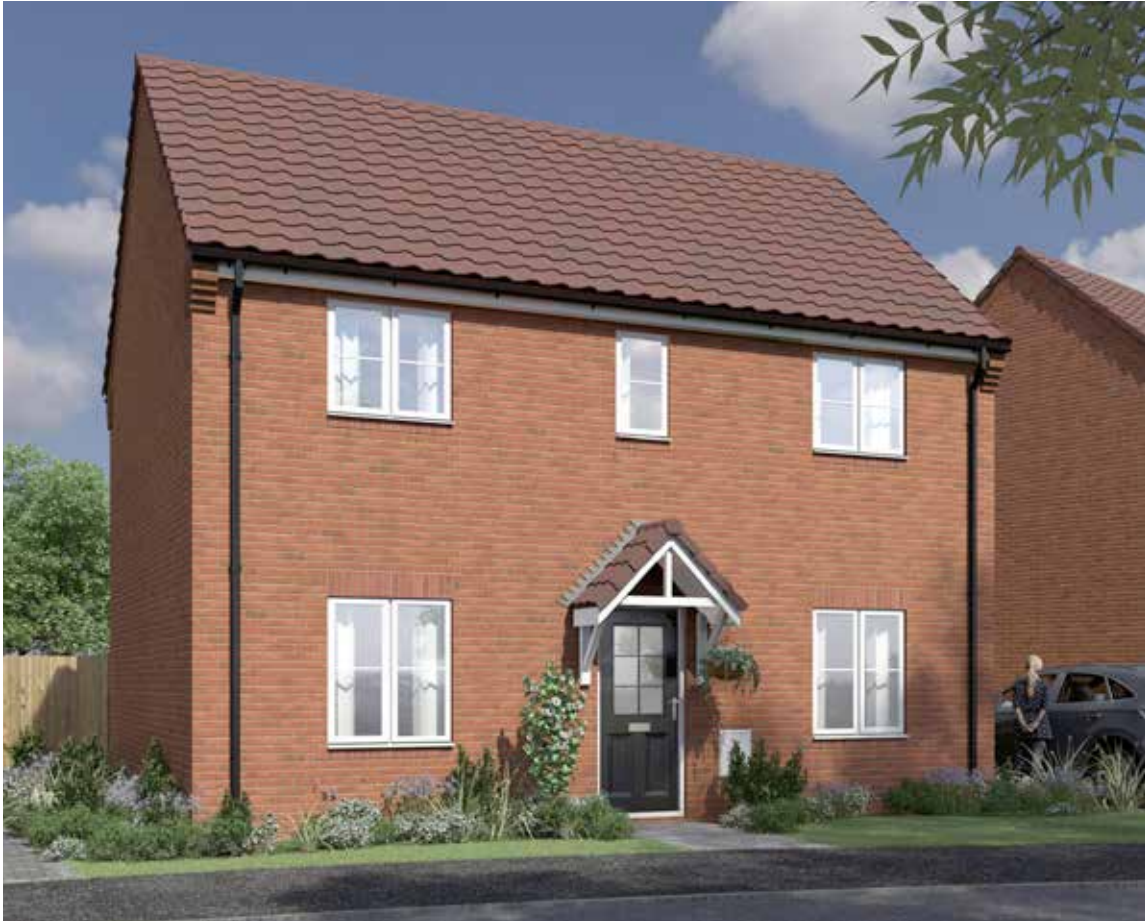
Computer generated image shown.