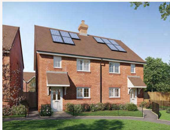
Computer generated image of The Madehurst, indicative only