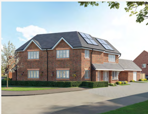
Computer generated image of The Felpham, indicative only