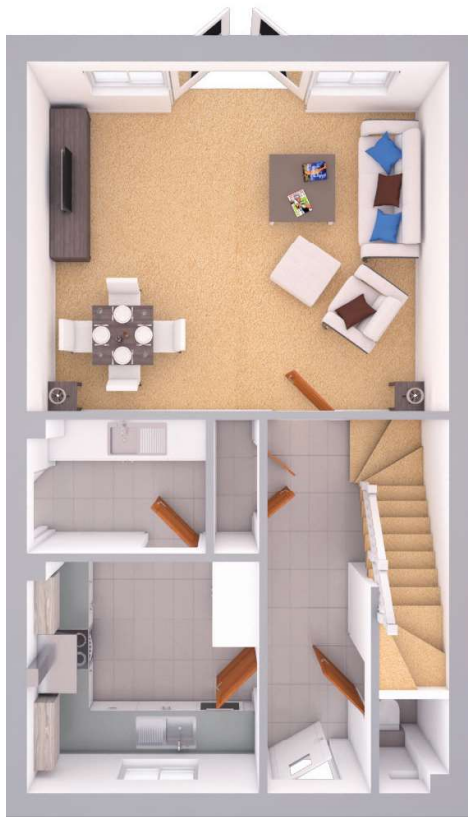
↑ GROUND FLOOR

PLOT 26 | 6 ROMNEY ROAD, ALLINGTON, MAIDSTONE, KENT, ME16 0XU