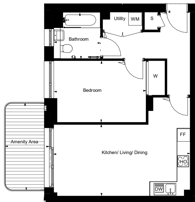
Flat Plan, Plot 43 1 : 100