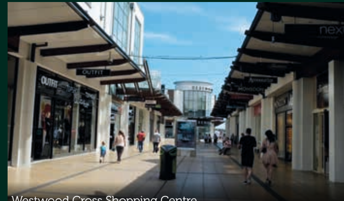
Westwood Cross Shopping Centre

positioned to provide the best of the countryside and the coastline, with all the modern comforts nearby.