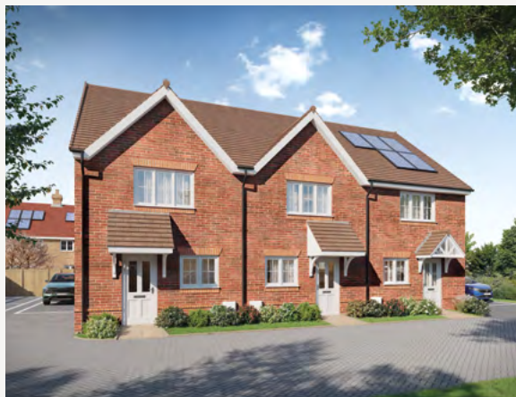
Computer generated image of The Kingston, indicative only