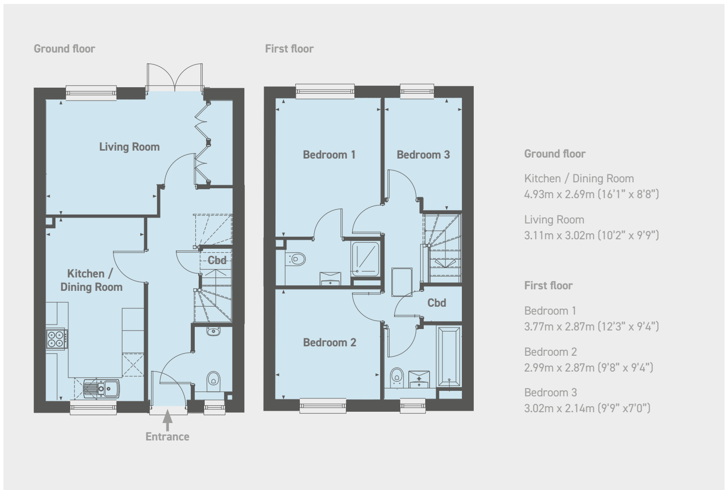
Illustration is indicative only

Please note that all sales particulars and images are for marketing and illustrative purposes only. Plans may contain elements which are not present upon the final completion of the property. All room dimensions are approximate and are for general guidance only.