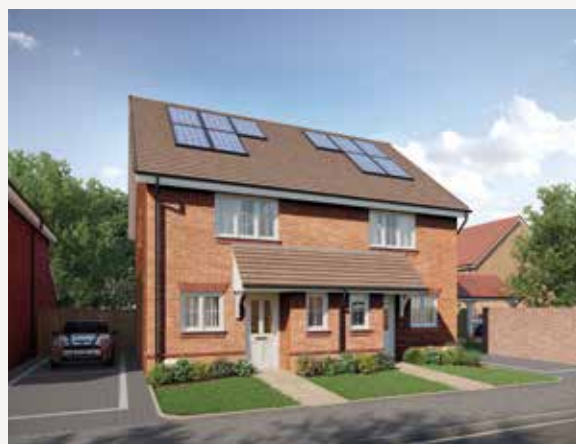
Computer generated image of The Eastergate, indicative only