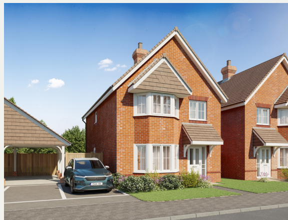
Computer generated image of The Barnham, indicative only