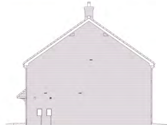
PLOT 300 SIDE ELEVATION