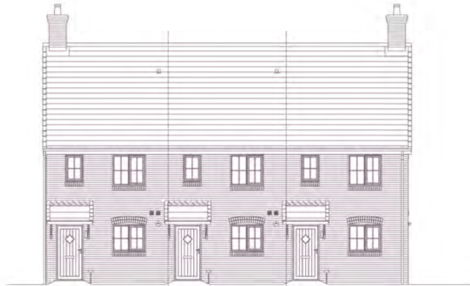
PLOT 298 PLOT 299 PLOT 300 FRONT ELEVATION