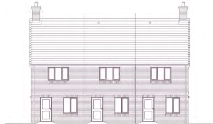
PLOT 300 PLOT 299 PLOT 298 REAR ELEVATION