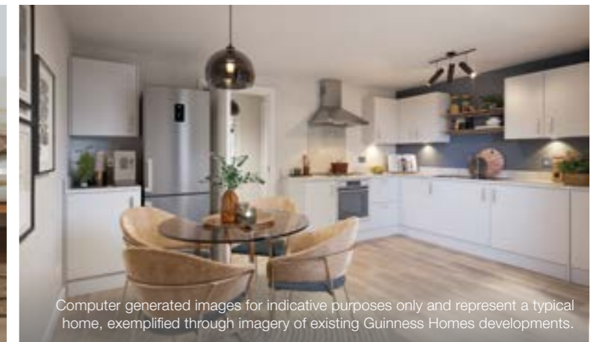
Computer generated images for indicative purposes only and represent a typical home, exemplified through imagery of existing Guinness Homes developments.