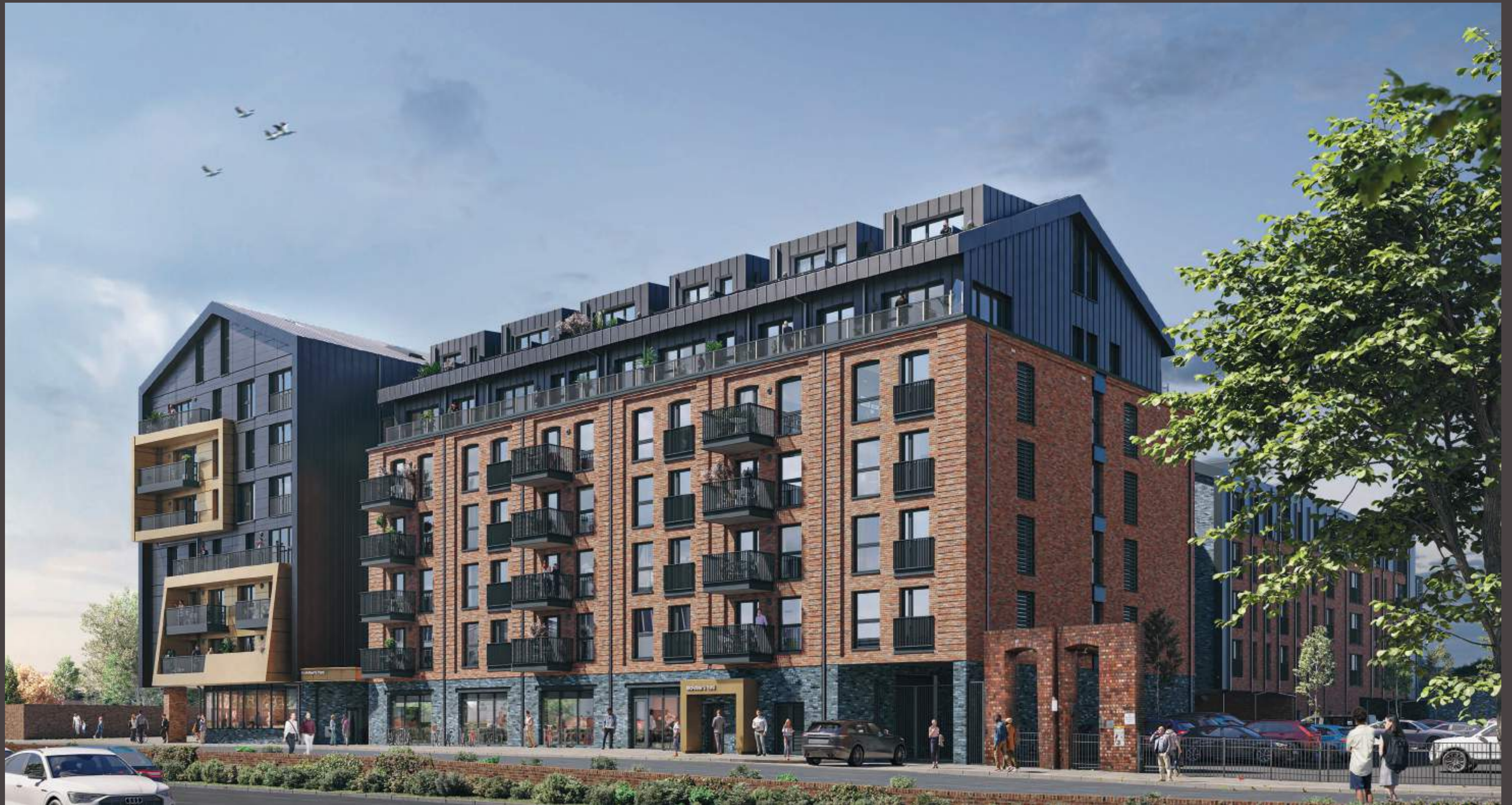
Computer generated image for illustrative purposes only.