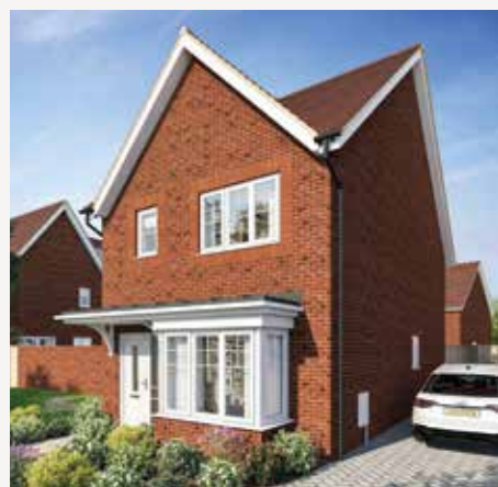
Computer generated image of The Ferring, indicative only