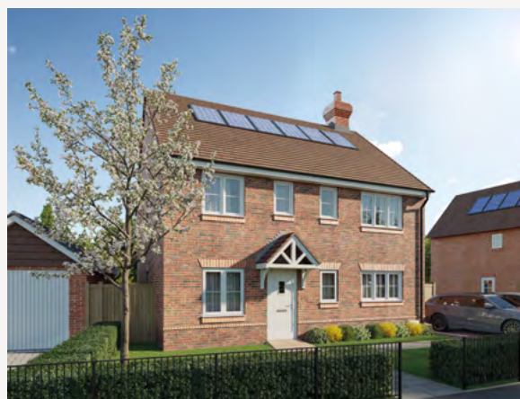
Computer generated image of The Arundel, indicative only