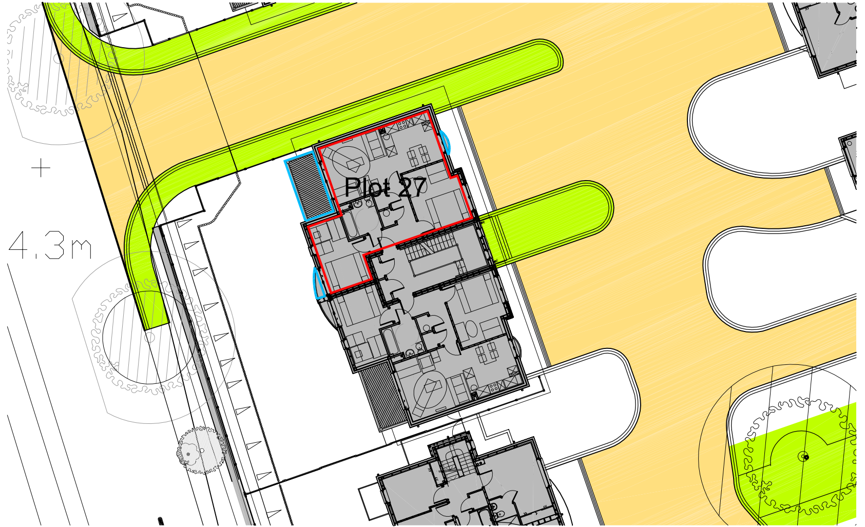
PLOT 27 - Conveyancing Plan @ Second Floor Level