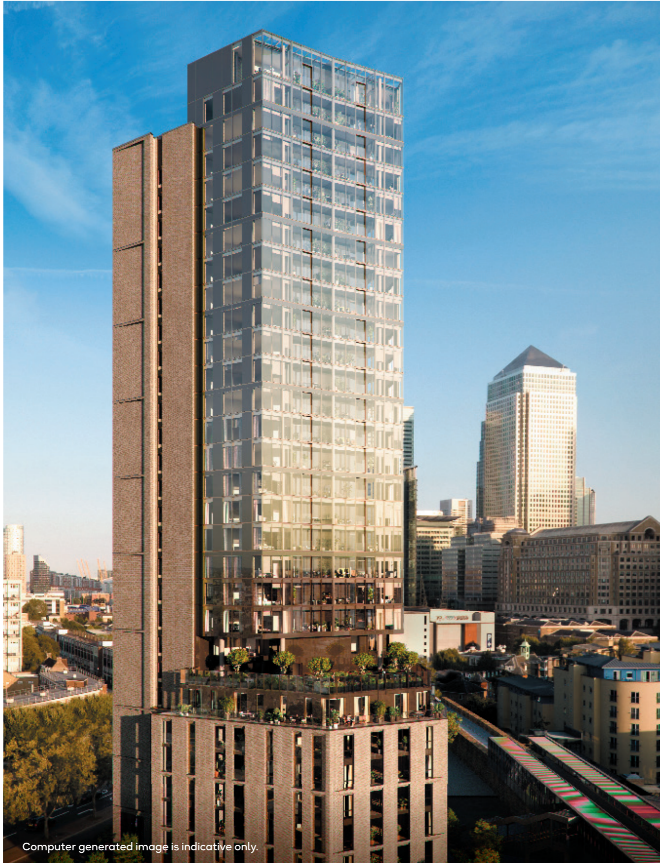
Exterior view of the building

Computer generated image is indicative only.