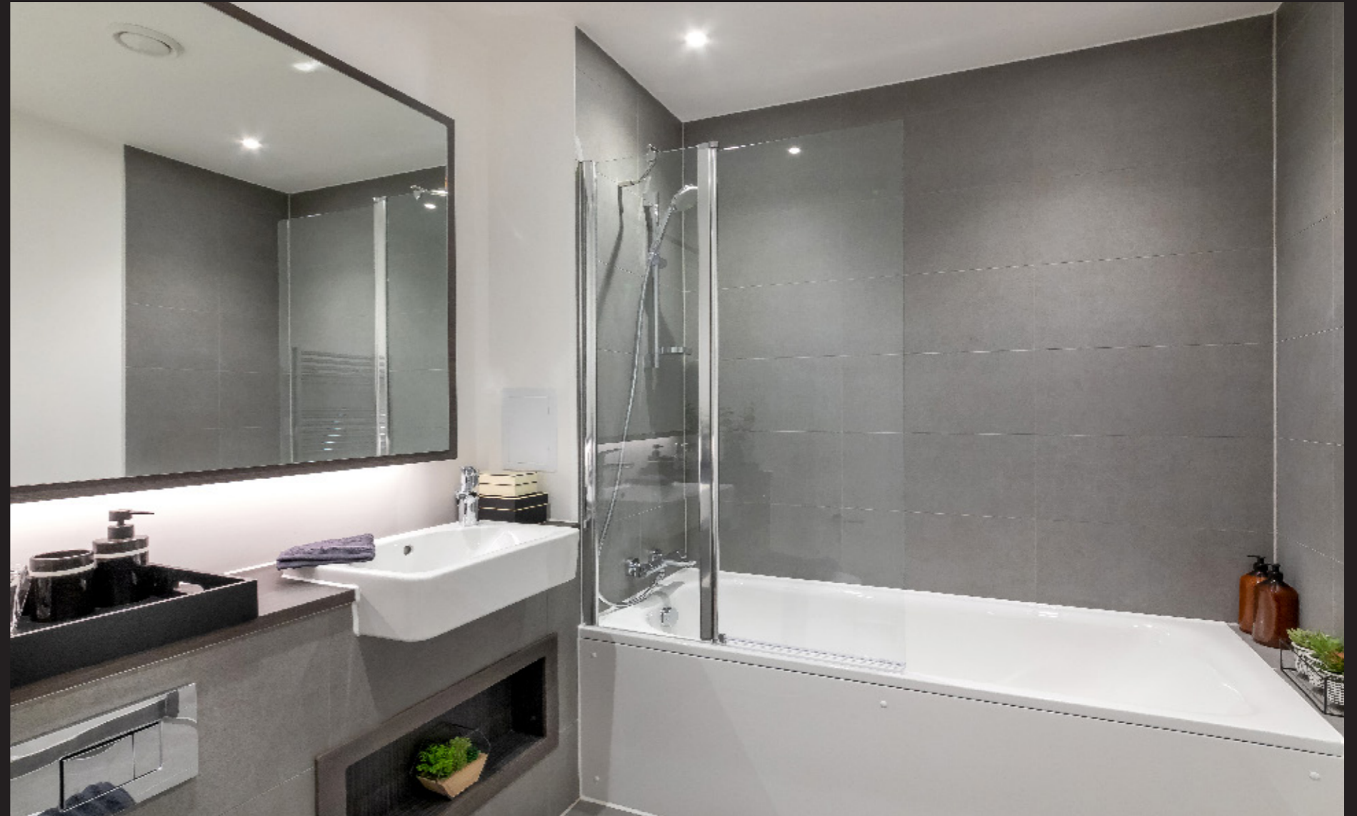
Photography is indicative only.