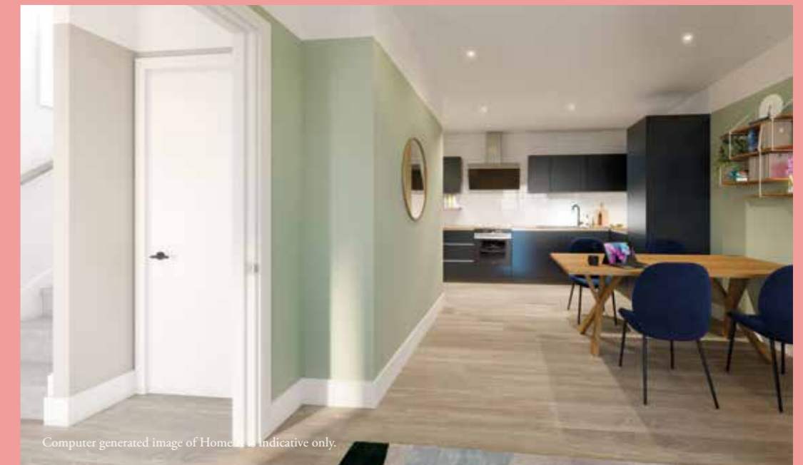
Computer generated image of Home X is indicative only.