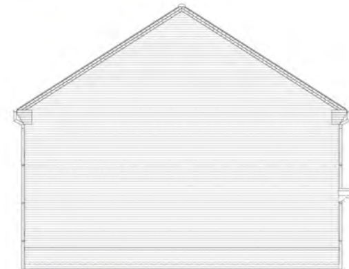
PLOT 56 SIDE ELEVATION