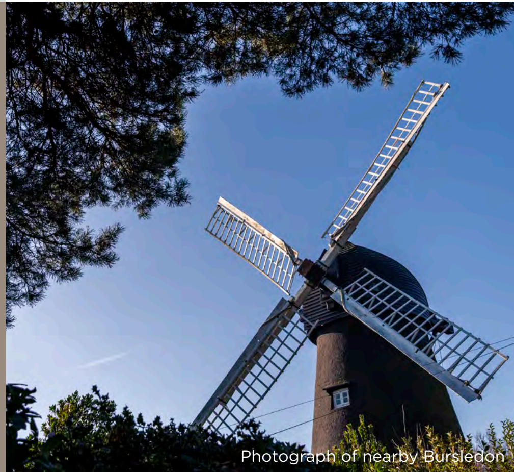
Photograph of nearby Bursledon

Southampton is a short drive away, where you'll find a useful selection of retailers, restaurants, bars, cinema, theatre and leisure centres