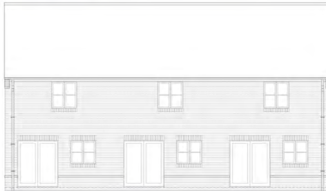
PLOT 58 REAR ELEVATION