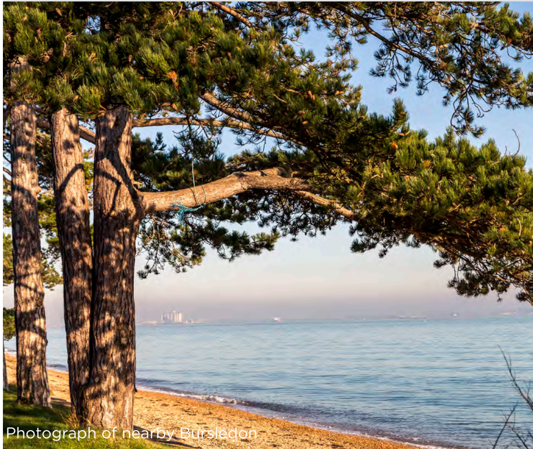
Photograph of nearby Bursledon