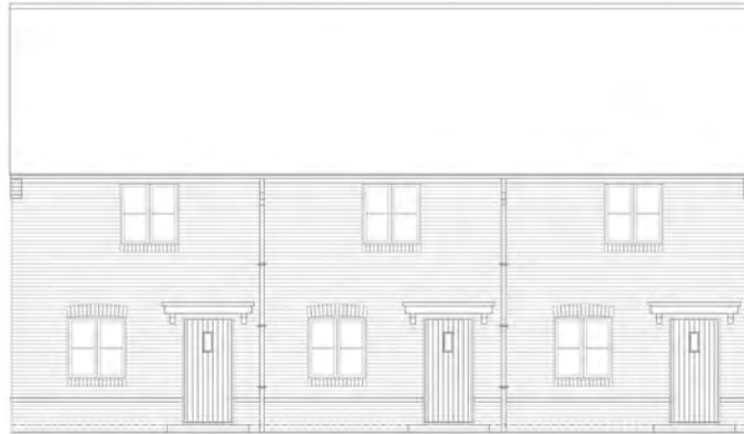
PLOT 56 FRONT ELEVATION