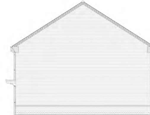
PLOT 58 SIDE ELEVATION