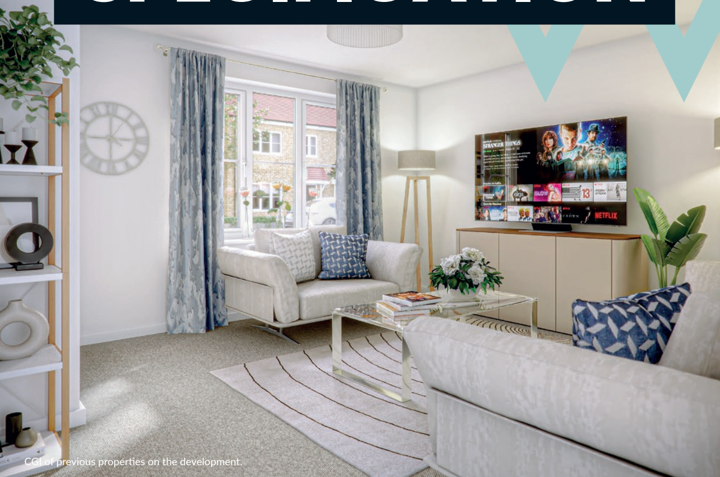
CGI of previous properties on the development.