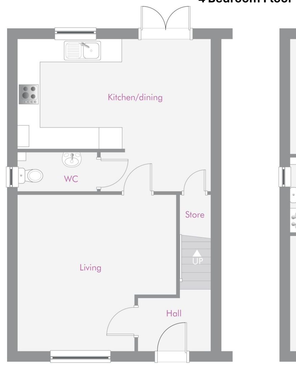
The Yew 4 Bedroom Floor Plan