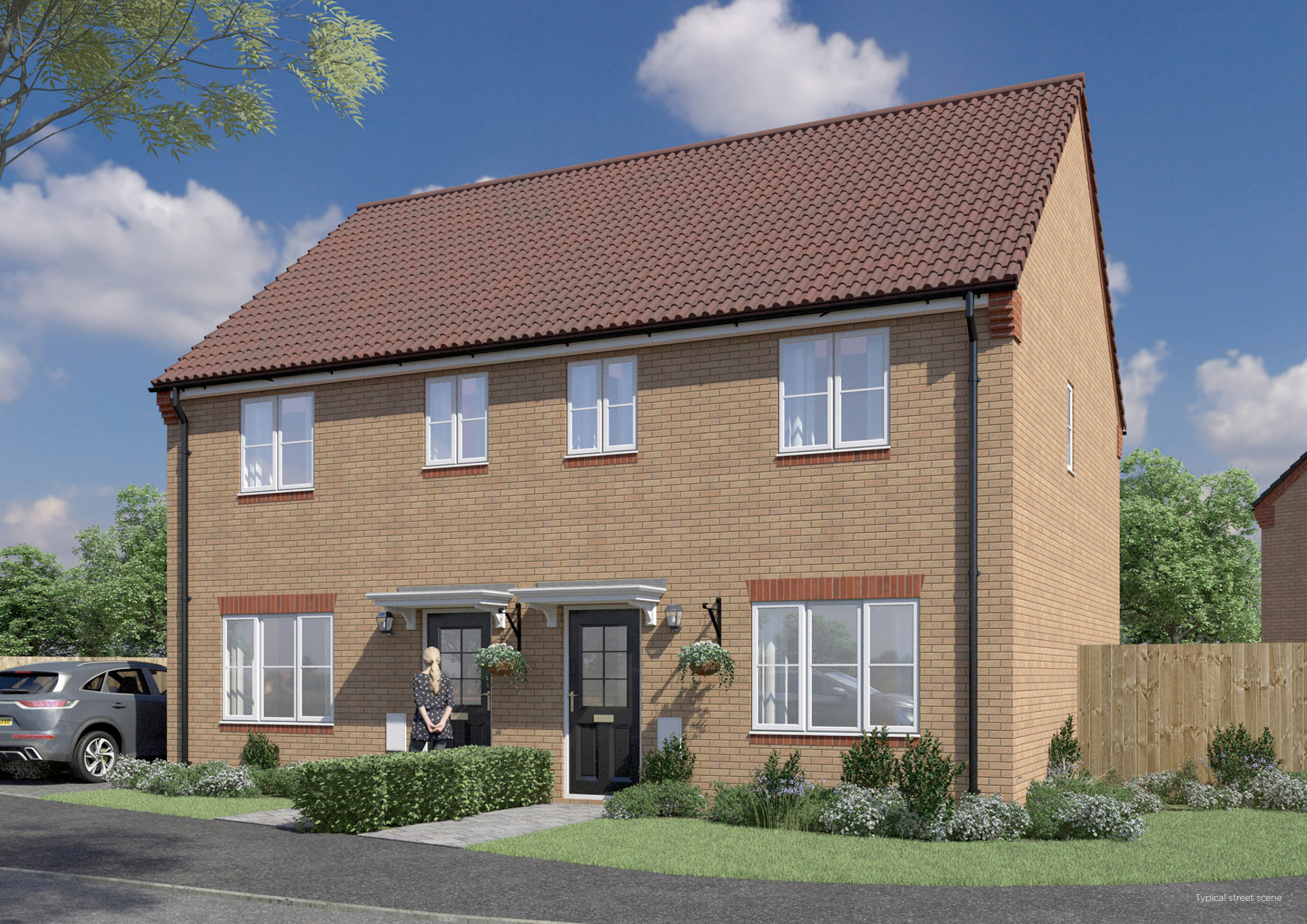
Typical street scene