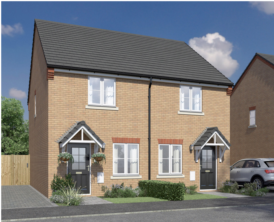
Computer generated image.