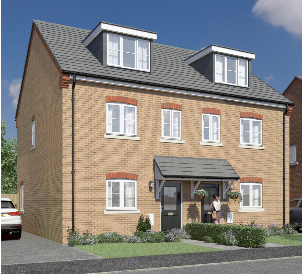
Computer generated image.