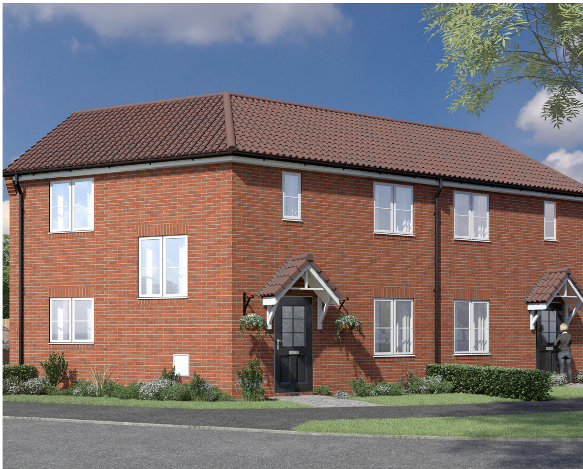
Computer generated image.