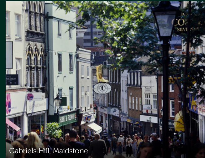
Gabriels Hill, Maidstone

Families will appreciate having infant, primary and secondary schools such as Ditton Infant School, Brookfield Junior School and The Malling School all within 2 miles. For higher education, MidKent College in Maidstone offers a wide range of degrees, apprenticeships and other tertiary education.