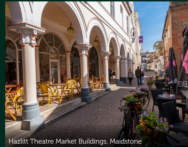
Hazlitt Theatre Market Buildings, Maidstone