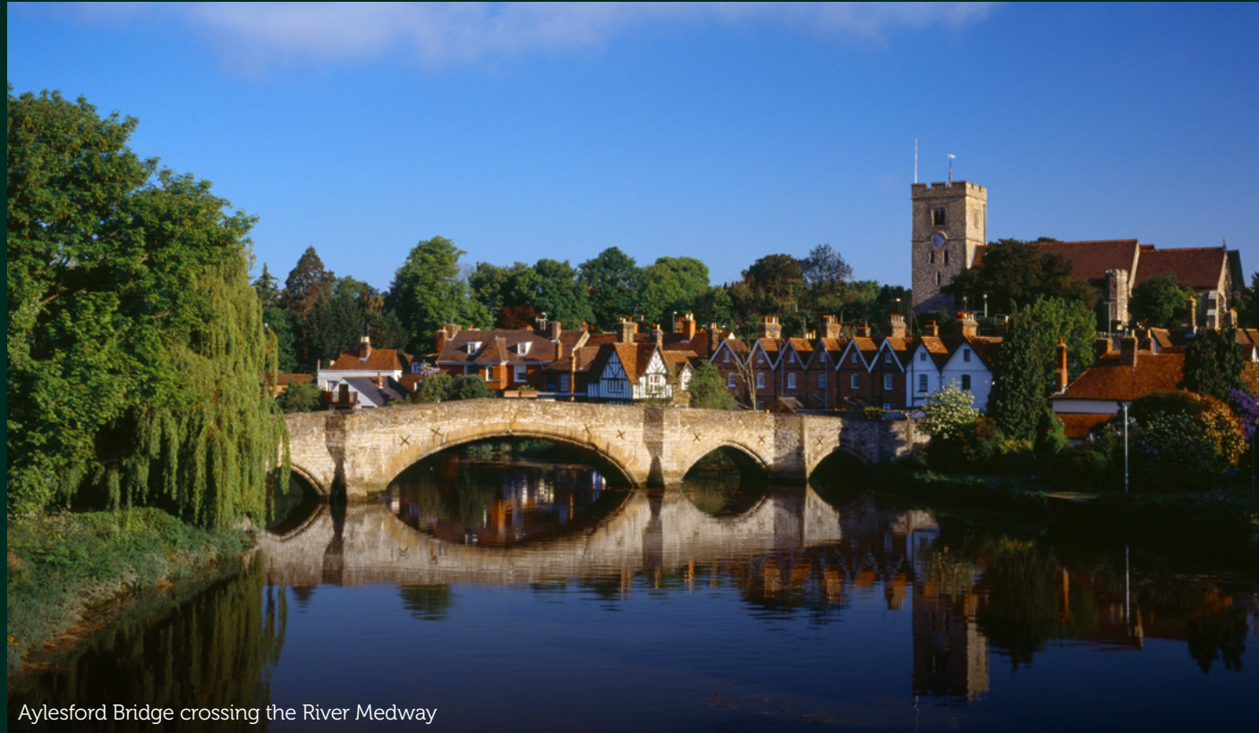
Aylesford Bridge crossing the River Medway