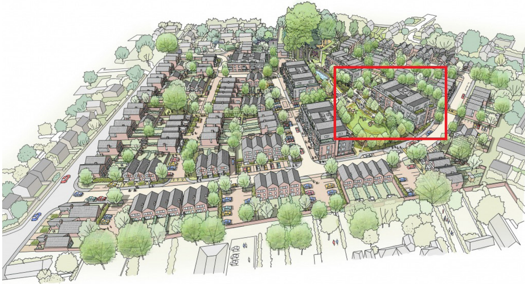
LOCATION AERIAL MAP